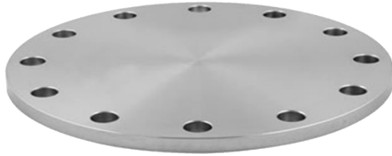
TABLE 5 AWWA C207 CLASS E RING & BLIND FLANGES